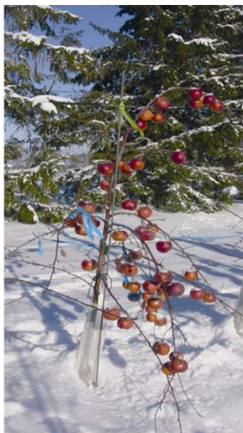
Trees of Eden™ and Persistence of Eden™ fruit at maturity. Photo taken on December 15, 2004.