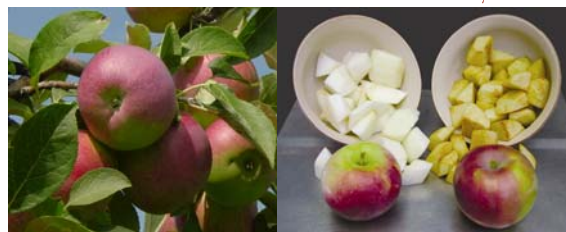
Fruits of Eden™ apple.

Eden™ is a dessert apple with improved firmness and crispness, high quality flesh and much longer shelf life than McIntosh and Cortland . The fruits have superior flavor and do not fall from the tree at maturity. The flesh is juicy, firm, crisp and resistant to bruising. No browning occurs after cutting, making it an excellent candidate for fresh fruit slices, fruit salad, dried apple chips and processing juice, cider).