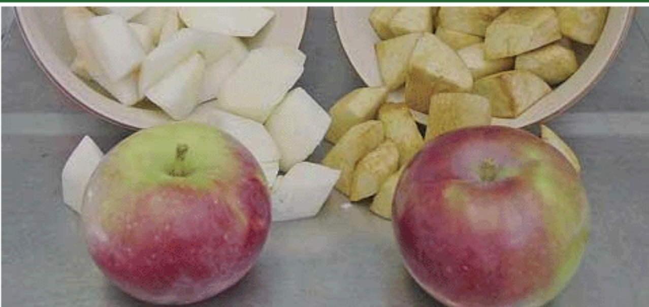
Eden, a new apple with flesh that is slow to turn brown, is compared with MacSpur, on the right. A dark red apple with pure white flesh, Eden could be ideal for making into apple chips, fresh-cut slices, or pie filling.

Subscriber Access Search Current Issue Back Issues Research