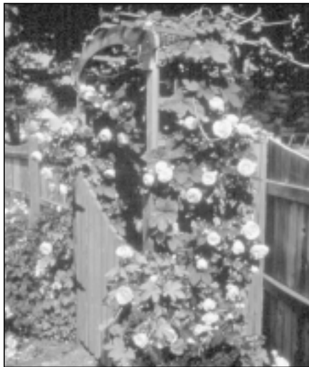
Rosa 'MEIVIOLIN' Eden Climber™ from The Conard-Pyle Company

Veronica spicata 'TICKLED PINK' . Originated by Michael Farrow and assigned to The Conard-Pyle Co. A mutation of 'Goodness Grows' that retained all popular qualities of parent, but has vivid bubble gum pink coloured blooms. Hardy from zone 5 to 9. USPP# 13,070, EECPR# 9,216.