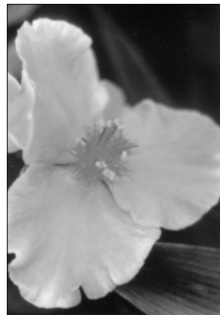
Tradescantia andersoniana 'PINK CHABLIS' from Darwin Plants