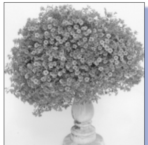
Calibrachoa 'WESCASAL' Celebration® Salmon originated by J. + H. Westhoff