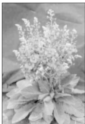
Verbascum 'PLUM SMOKEY' from Terra Nova Nurseries Inc.