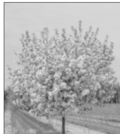
Malus 'LOLLIZAM' Lollipop® from Lake County Nursery inc.