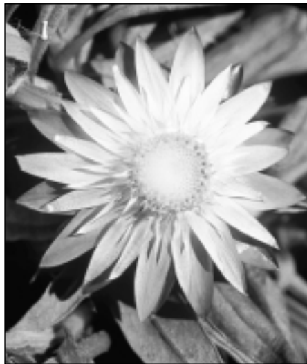
Bracteantha 'KLEBA04350' Mohave™ Strawberries n' Cream from Selecta Klemm GmbH & Co. KG

'CANDY GIRL' Purple-pink, compact with unusual