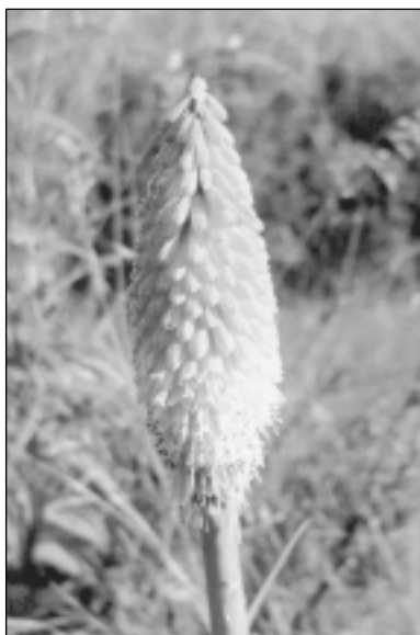
Kniphofia 'ARIEL'S MAGIC' from Monarch Landing Nursery

Although each variety had unique responses to the treatments, this study helped develop new techniques to guide hybridizers in their genetic programs for roses and to obtain improved germination rates.